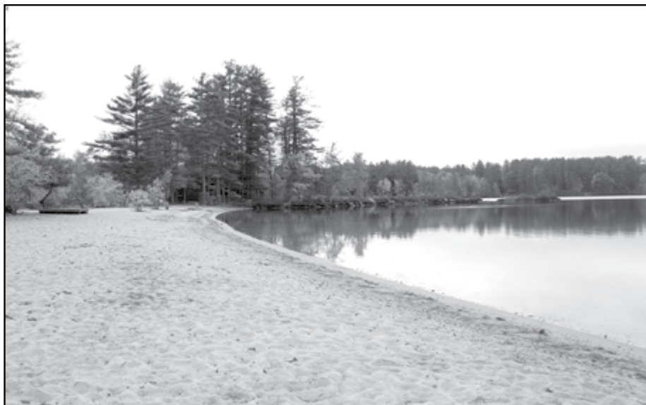
This is a pre-summer photo of Lovell Town Beach.